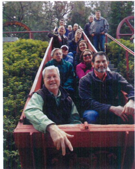
December 6, 2016 AEMA and Sierran Tour Members In Man-skip from Historic Idaho-Maryland Mine North Star Powerhouse and Pelton Wheel Museum